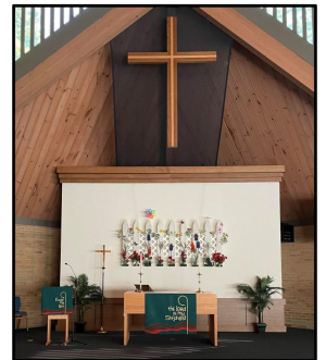
Prince of Peace Lutheran Church