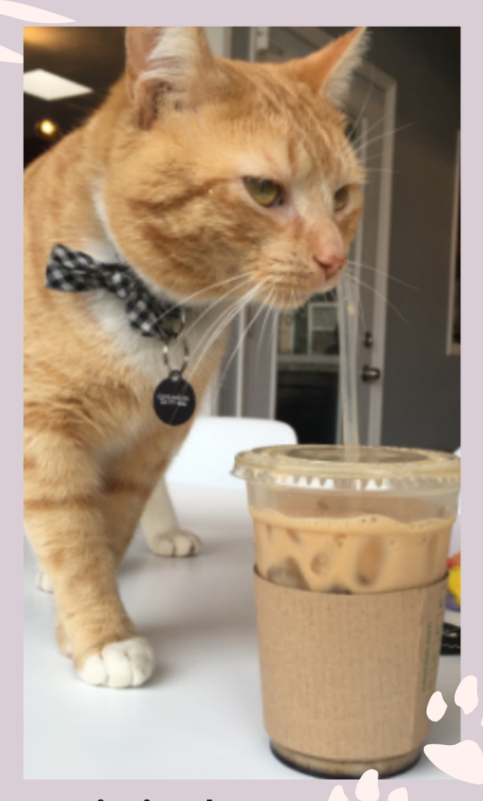
Limited spaces! Text Hilary to sign up