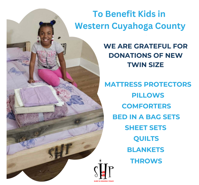
SHP is a 501 (c)(3) non-profit organization that works with community volunteers to build and deliver beds to kids who don't have them.