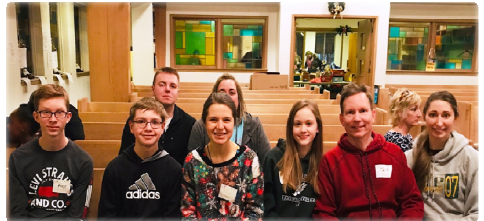
Bag and Wrap at Redeemer Crisis Center. Thank you Prince of Peace Westlake volunteers & youth!

Please mail this document and your check as indicated on the form. Please also make a copy of this registration page for me to keep as proof you are signed up and attending.