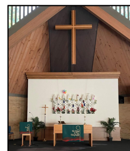
Prince of Peace Lutheran Church