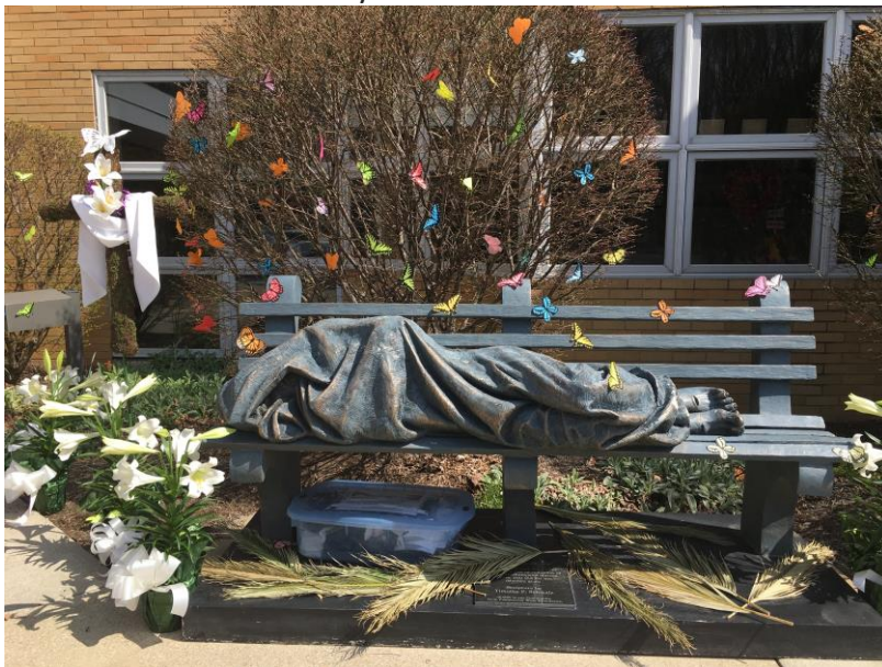
Pictured is the 'Homeless Jesus' decorated for Easter